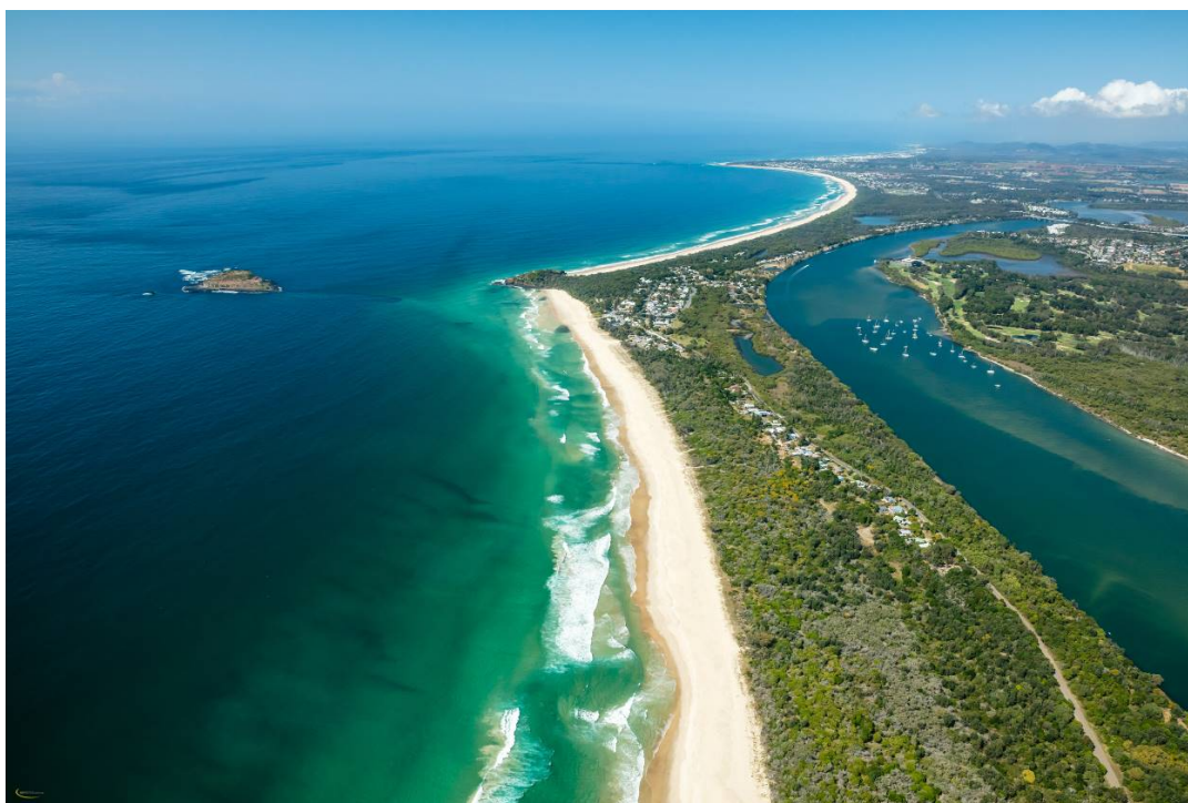
Figure 2 – Letitia Spit looking south