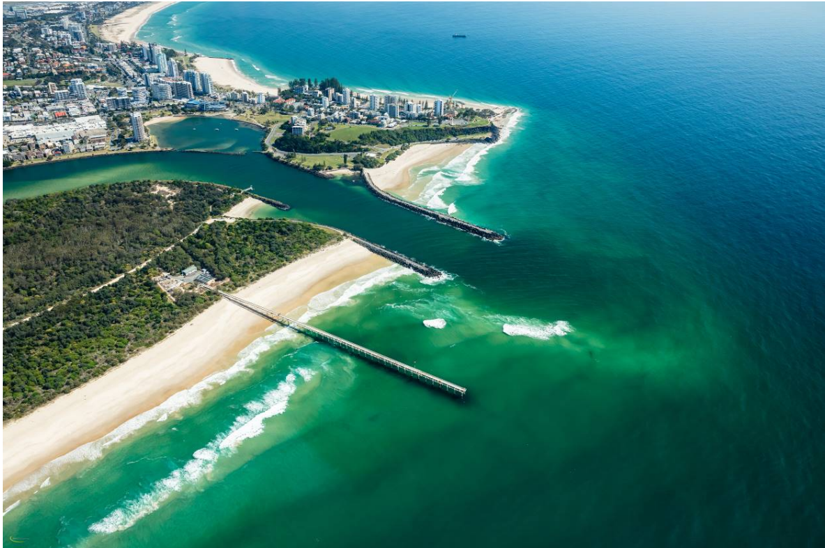
Figure 3 – North Letitia, Tweed River Entrance and Duranbah looking west

North Letitia, Tweed River Entrance and Duranbah