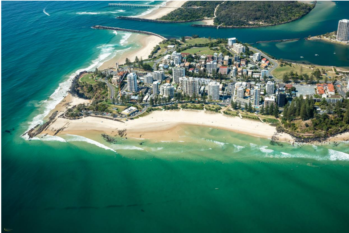
Figure 5 – Snapper Rocks looking south