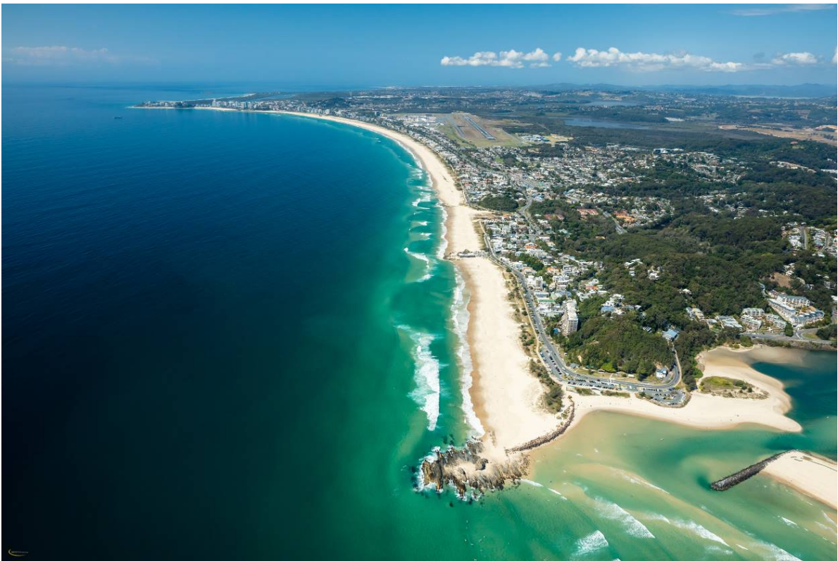
Figure 8 – Currumbin looking south