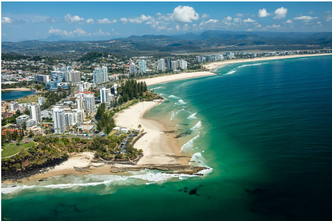
Figure 6 – Snapper Rocks to Kirra