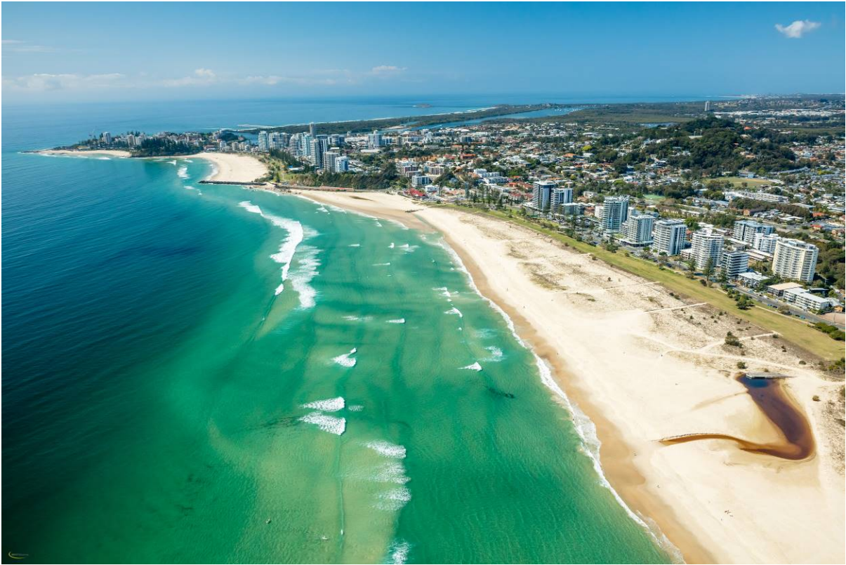
Figure 7 – Kirra looking south