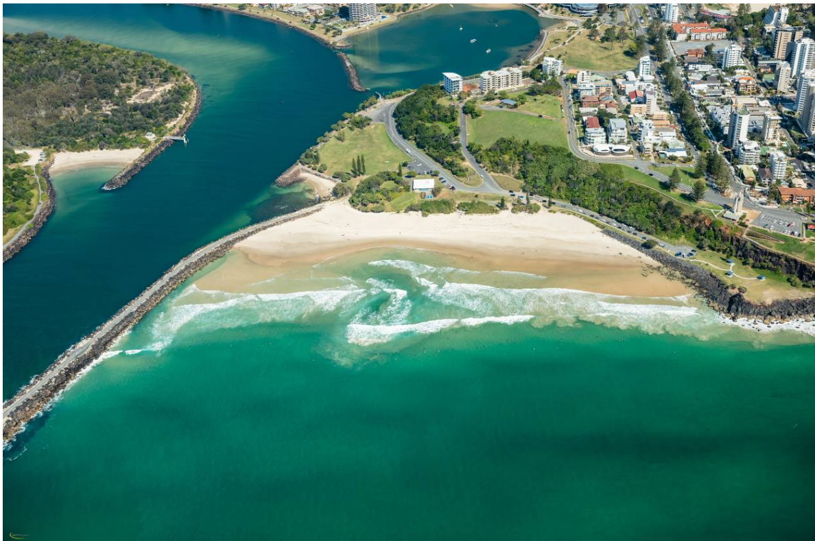
Figure 4 – Duranbah looking west