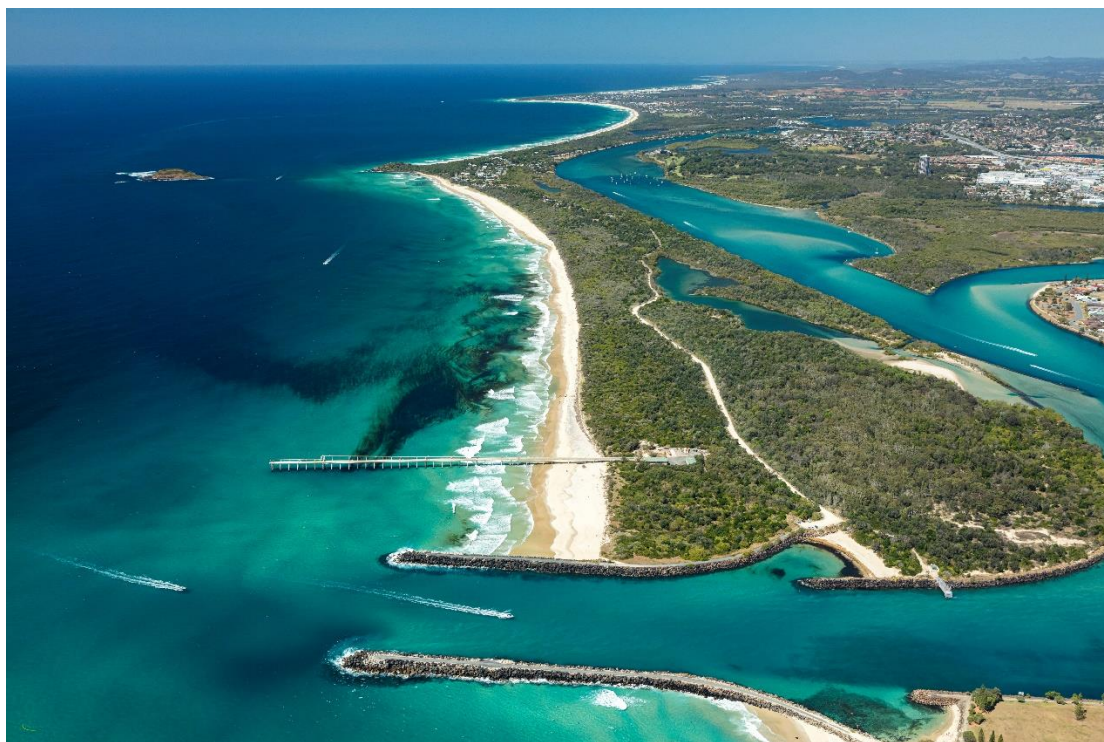
Figure 2 – Letitia Spit looking south