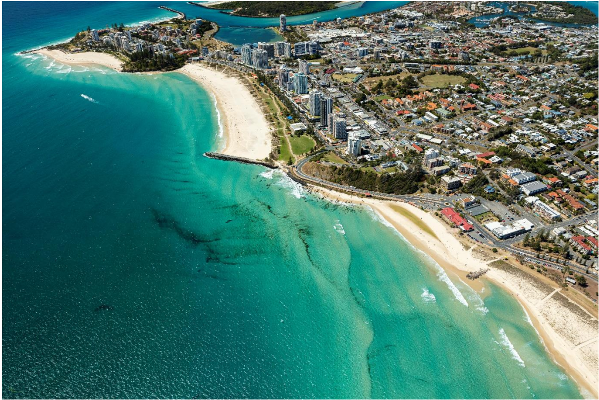
Figure 7 – Kirra looking south