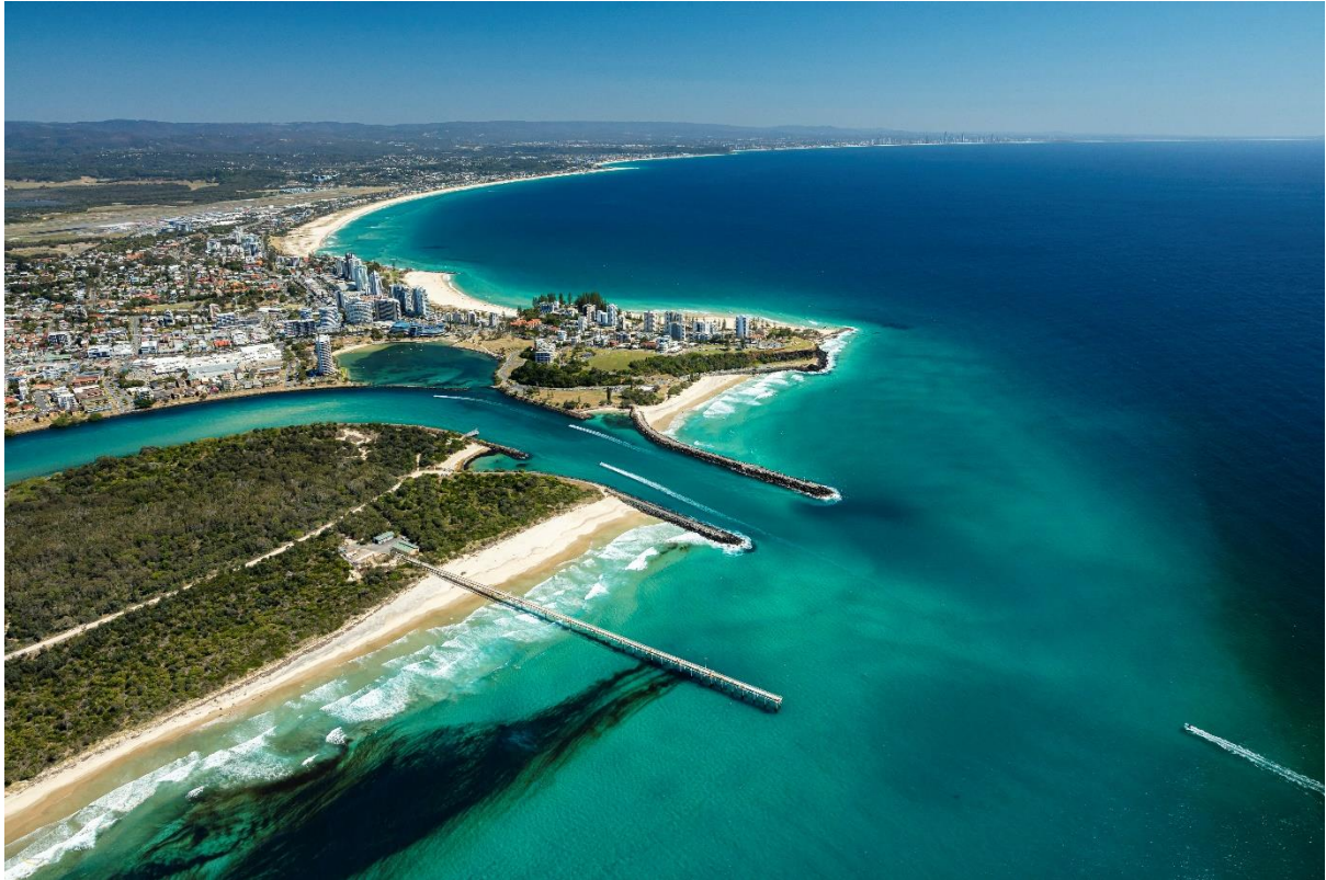
Figure 3 – North Letitia, Tweed River Entrance and Duranbah looking west

North Letitia, Tweed River Entrance and Duranbah