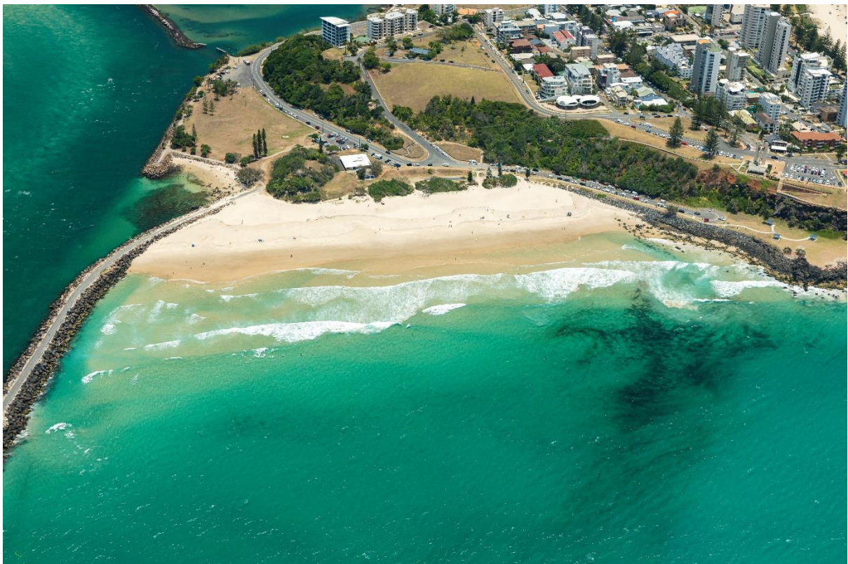
Figure 4 – Duranbah looking west