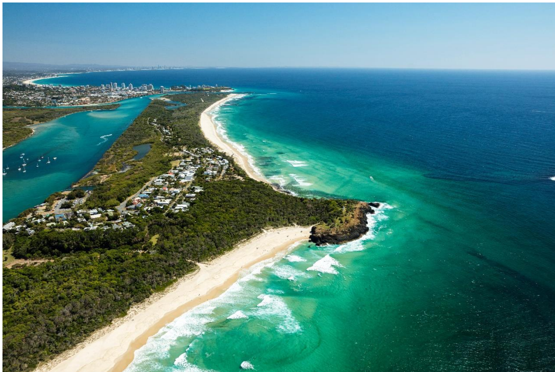
Figure 1 – Fingal Head looking north