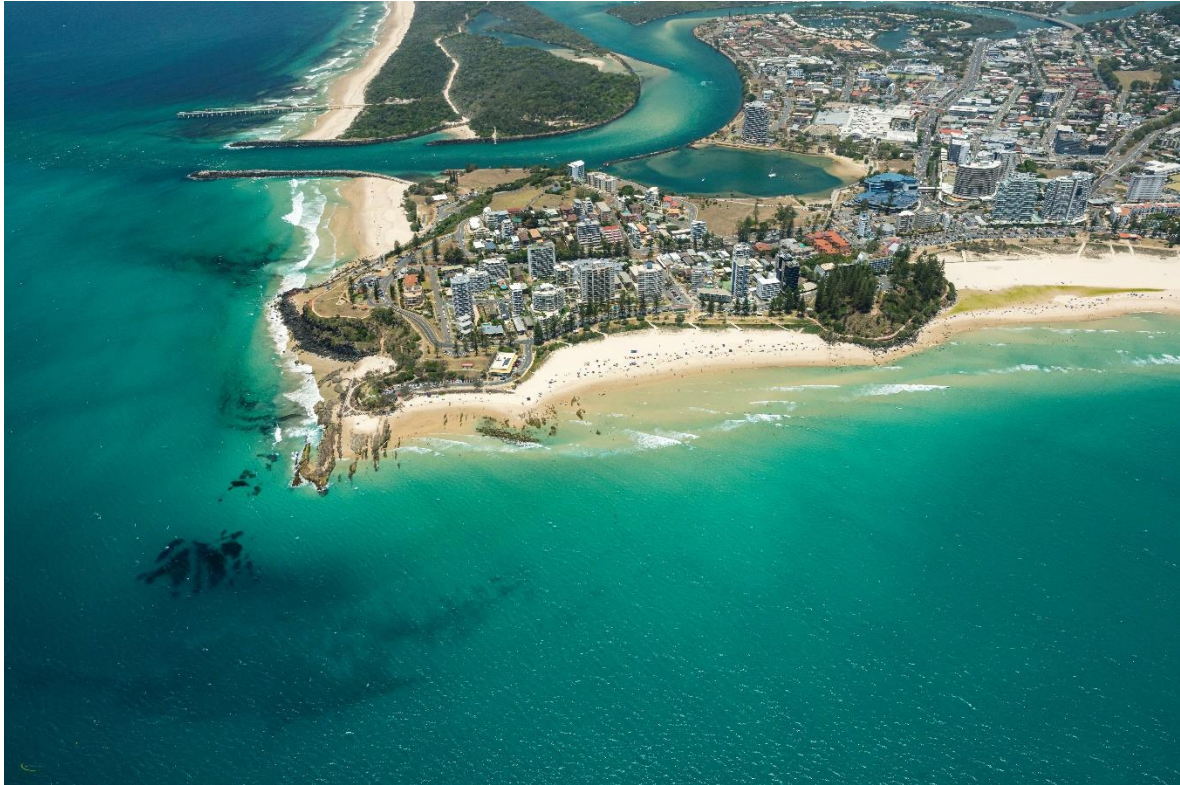
Figure 5 – Snapper Rocks looking south