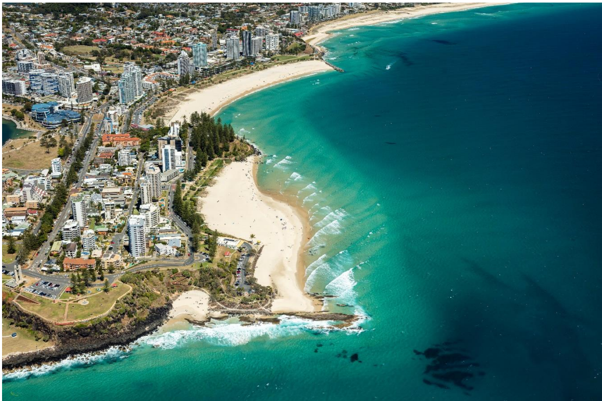
Figure 6 – Snapper Rocks to Kirra